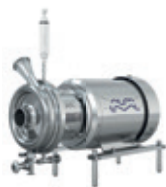
Alfa Laval LKH UltraPure