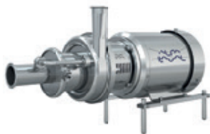
Alfa Laval LKH Prime

Alfa Laval LKH Prime UltraPure is available with Alfa Laval Q-doc, our comprehensive documentation package meeting the standards required for the pharmaceutical industry.