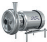
Alfa Laval LKH