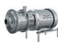
Alfa Laval LKH Multistage