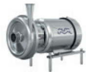
Alfa Laval LKH Evap