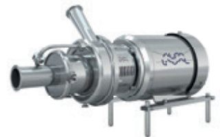
Alfa Laval LKH Prime UltraPure

The latest in Alfa Laval's premium range of best-selling hygienic centrifugal pumps.