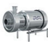
Alfa Laval LKHHPF