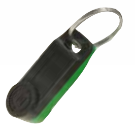
Saunders® I-VUE Target

Air fittings (not supplied) Air Tube/Pipe (not supplied)