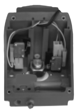
Housing is designed to accommodate a variety of switch options, including proximity or mechanical switches.