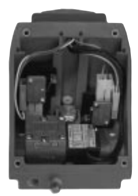
Control Top can also be fitted with a 3-way/4-way solenoid with integral flow control.