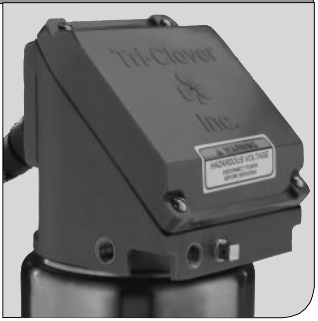
Fig. 1. Control/Indication Top

Additional application versatility can be achieved by specifying a solenoid in the control housing. This transforms the valve into a solenoid operated air valve with integral flow control. The module will then provide valve position feedback through your choice of mechanical switches or proximity switches.