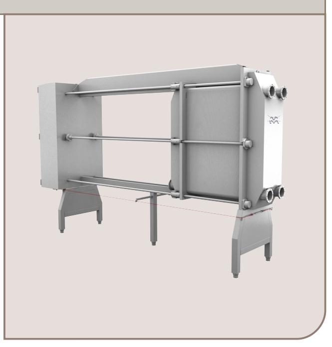
FrontLine™ 15 Automatic

The plates are fitted with a gasket which seals the inter-plate channel and directs the fluids into alternate channels. The number of plates is determined by the flow rate, physical properties of the fluids and the temperature program. Connections may be located in the frame plate, the pressure plate and the connection plate.