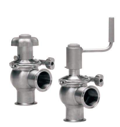
Tri-Clover Unique 7000 - Manually operated valves Manually operated and regulating valves that have the same versatility and hygienic qualities as the entire Unique 7000 range.

Knowing that tank sizes and configurations vary, the body can be turned in any position if the Tri-Clamps are slightly loosened. Valve sizes range from 2" to 4" and are supplied with the tank flange that gets welded directly into the tank.