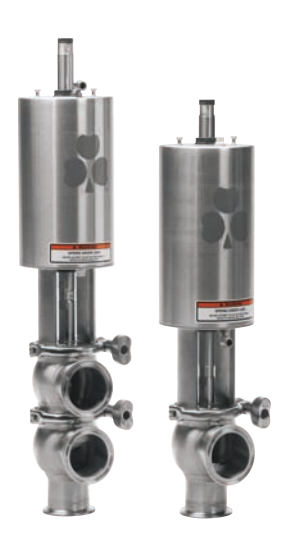
Tri-Clover Unique 7000 – Long stroke For processing suspended solids or high viscosity products.