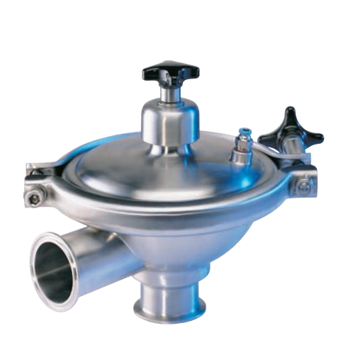
CPM-2 When you need to keep your product under even pressure.

The LKB is also available in a low pressure version for pressure up to 75 psi. The LKB-LP is only available as a manually operated valve.