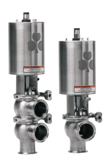
Tri-Clover Unique 7000 - Aseptic valve Built for aseptic operating conditions such as high sterilization temperatures.

This aseptic version best illustrates the modularity and interchangeability of parts available. While the bonnet and stem configurations can vary, the diaphragm, body(s), actuator, clamps, stem guide bushing are all standard and common interchangeable components. As a result, less spare parts are needed which translates into low parts inventory and ultimately lower cost of valve ownership.