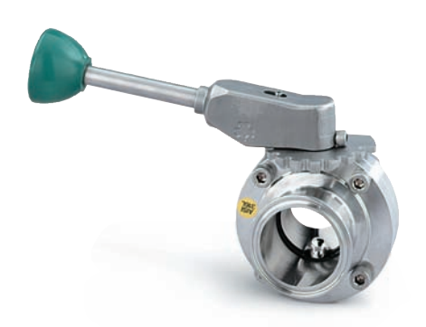
LKB Economical on/off routing valves for low and medium viscosity product.