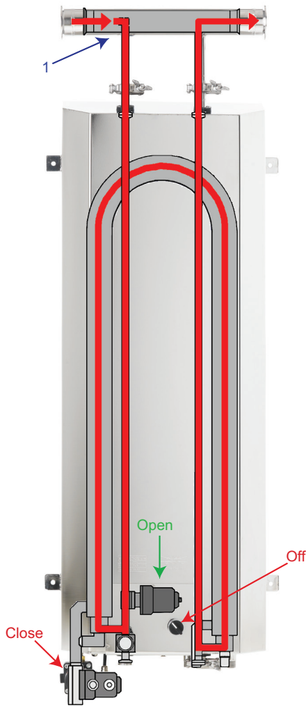
Figure 1. Stand-by mode