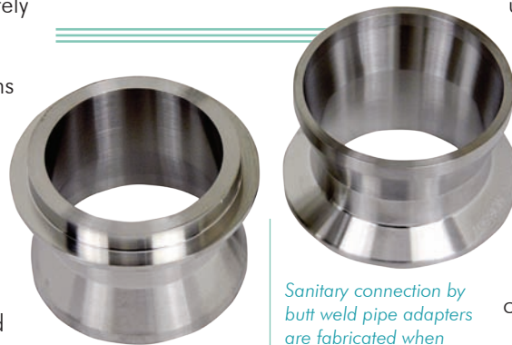
Sanitary connection by butt weld pipe adapters are fabricated when there is a need to convert the end of pipe to a sanitary connection (male I-line shown).

When working with CSI, you have the advantage of our shop's capabilities to quickly produce the needed fittings for your project.