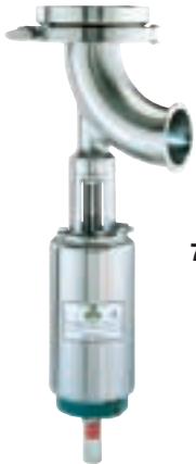
700 Tank Outlet