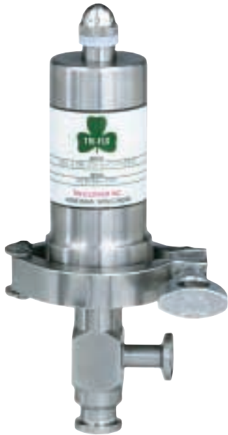
Series 650 and 655 Air-Actuated Valves

The wide range of styles (manual shut-off, air-actuated, relief, sample and check), together with the available surface finish and elastomer options, enable the processor to match the valve to the specific application. These fractional valves also provide long service life and are easy to maintain.