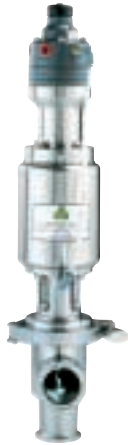
771 Air Operated Regulating Valve