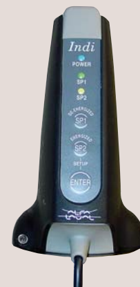
The indication unit IndiTop from Alfa Laval.