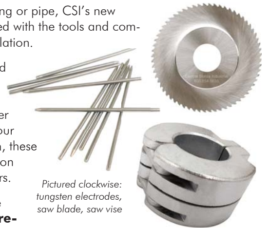
Pictured clockwise: tungsten electrodes, saw blade, saw vise

CSI's saw blades for orbital tube and pipe saws are made of the highest quality tool steel and have earned a solid reputation for outperforming other manufacturers' blades. Available in four styles for wall thicknesses up to 1/4 inch, these competitively priced blades are precision ground to fit most tube and pipe cutters.