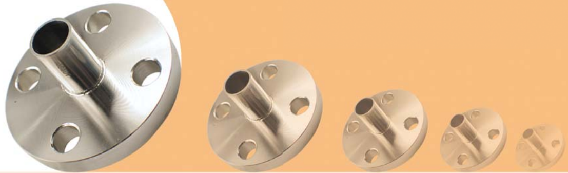
38BW-FLANGE BY TUBE BUTT-WELD